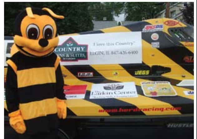
Herd Racing's Bumble Bee Mascot