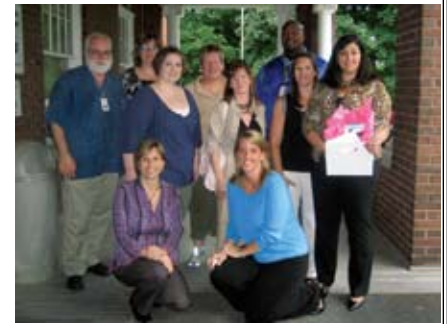
Elgin Junior Service Board presenting their donation to Larkin Center staff.