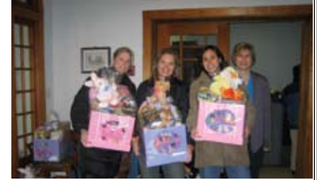
The Biltmore/Oaksbury Moms Network

This past year we had the opportunity to talk with the Elgin Junior Service Board about the services and programs we provide. They were so moved by our mission that they wanted to help us out in some way and help us out they did! This group spent weeks soliciting for donations that we could incorporate in our program based community activities which allowed our children to participate in fun activities throughout the community such as bowling, eating out at a restaurant, working out at a fitness center, movie theatre tickets and a special pool party at the Elgin Country Club. What a gift to feel like any other kid.